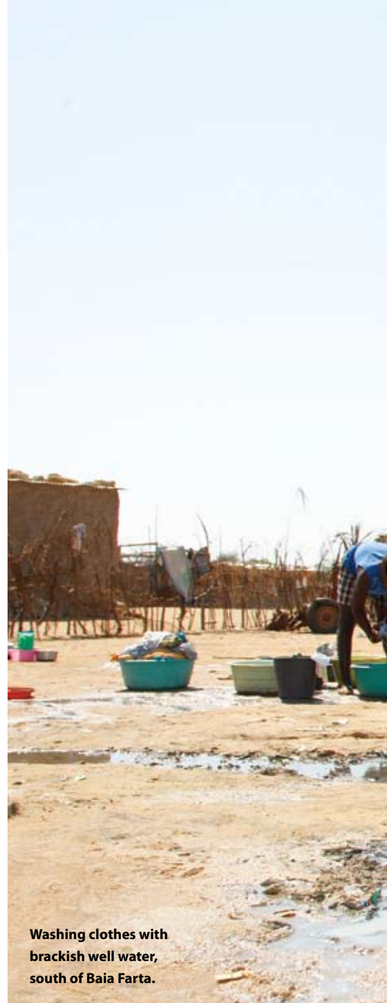
Washing clothes with brackish well water, south of Baia Farta.