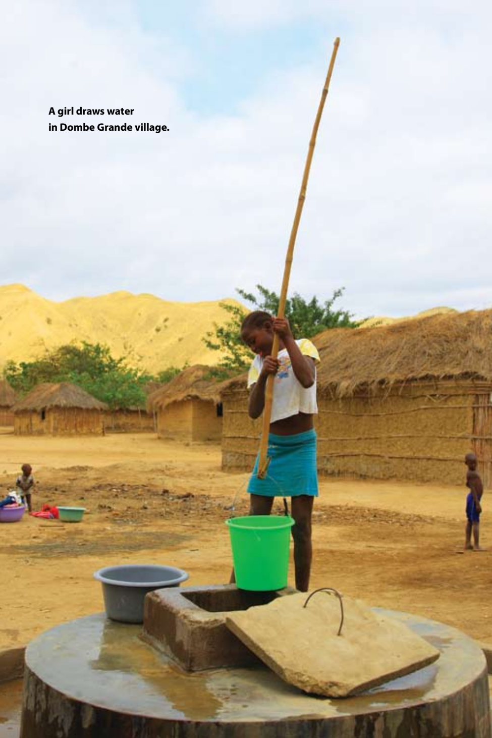
A girl draws water in Dombe Grande village.