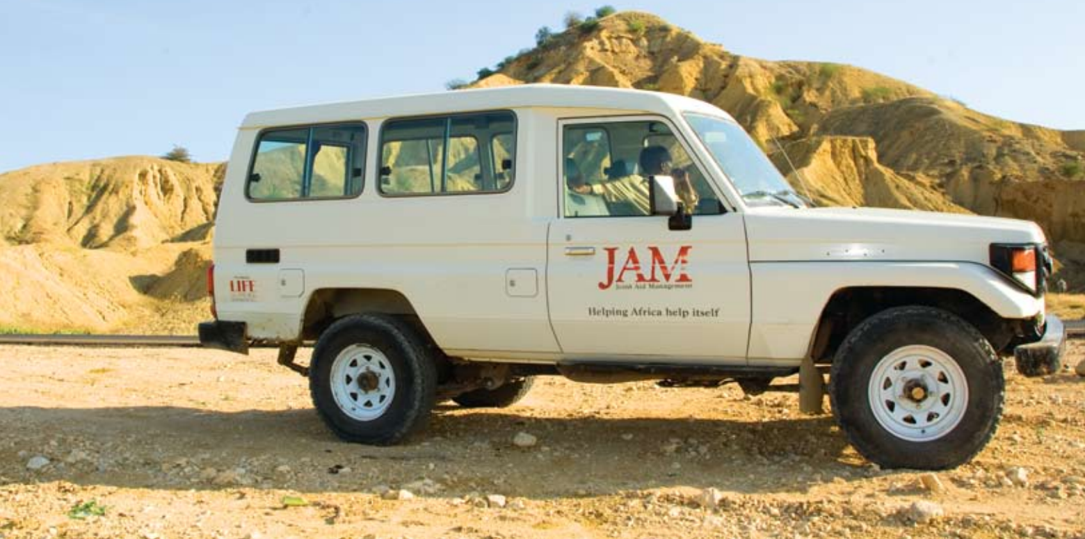
A Joint Aid Management Land Cruiser, south of Benguela, Angola.