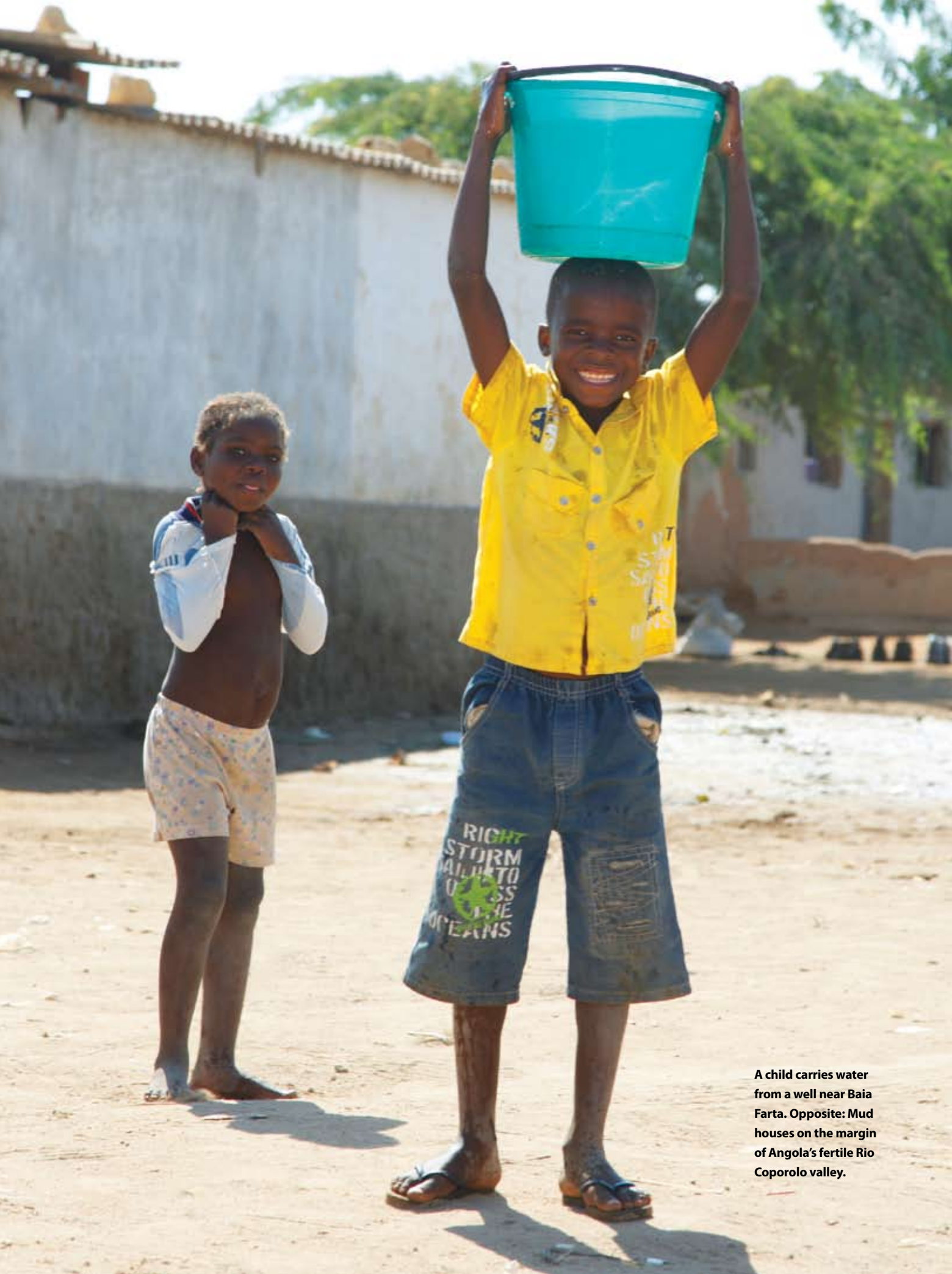
A child carries water from a well near Baia Farta. Opposite: Mud houses on the margin of Angola's fertile Rio Coporolo valley.